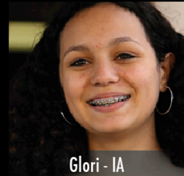
Glori - IA

Join us for an evening of film, food, conversation & hope